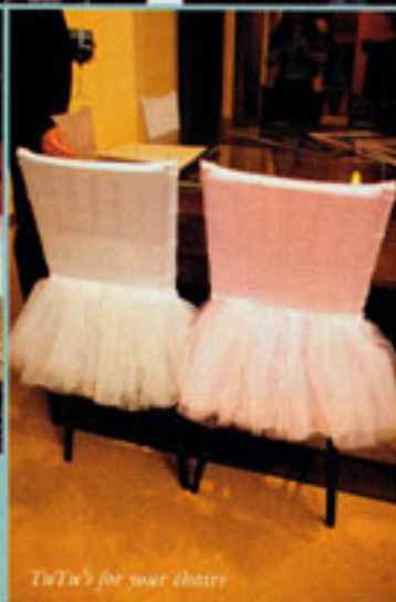
Tutu's for your chairs